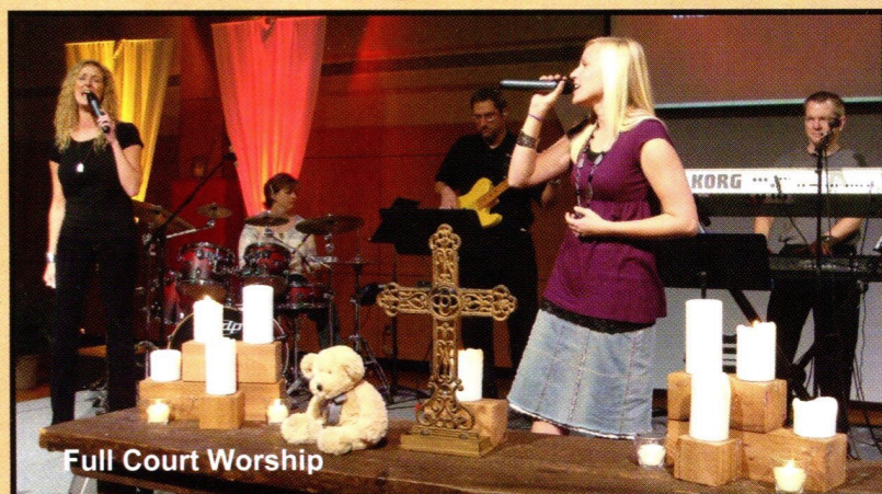
Full Court Worship

The music program also includes The Carillon Ringers (handbells), CUMC Jazz Ensemble , CUMC Men's Chorus , CUMC Orchestra and CUMC Youth Orchestra as well as various ensembles and instrumentalists, often featured as soloists in our worship services. Our Full Court Worship service includes a team of very talented and dedicated musicians who play and sing regularly for our 11:00 a.m. contemporary service.