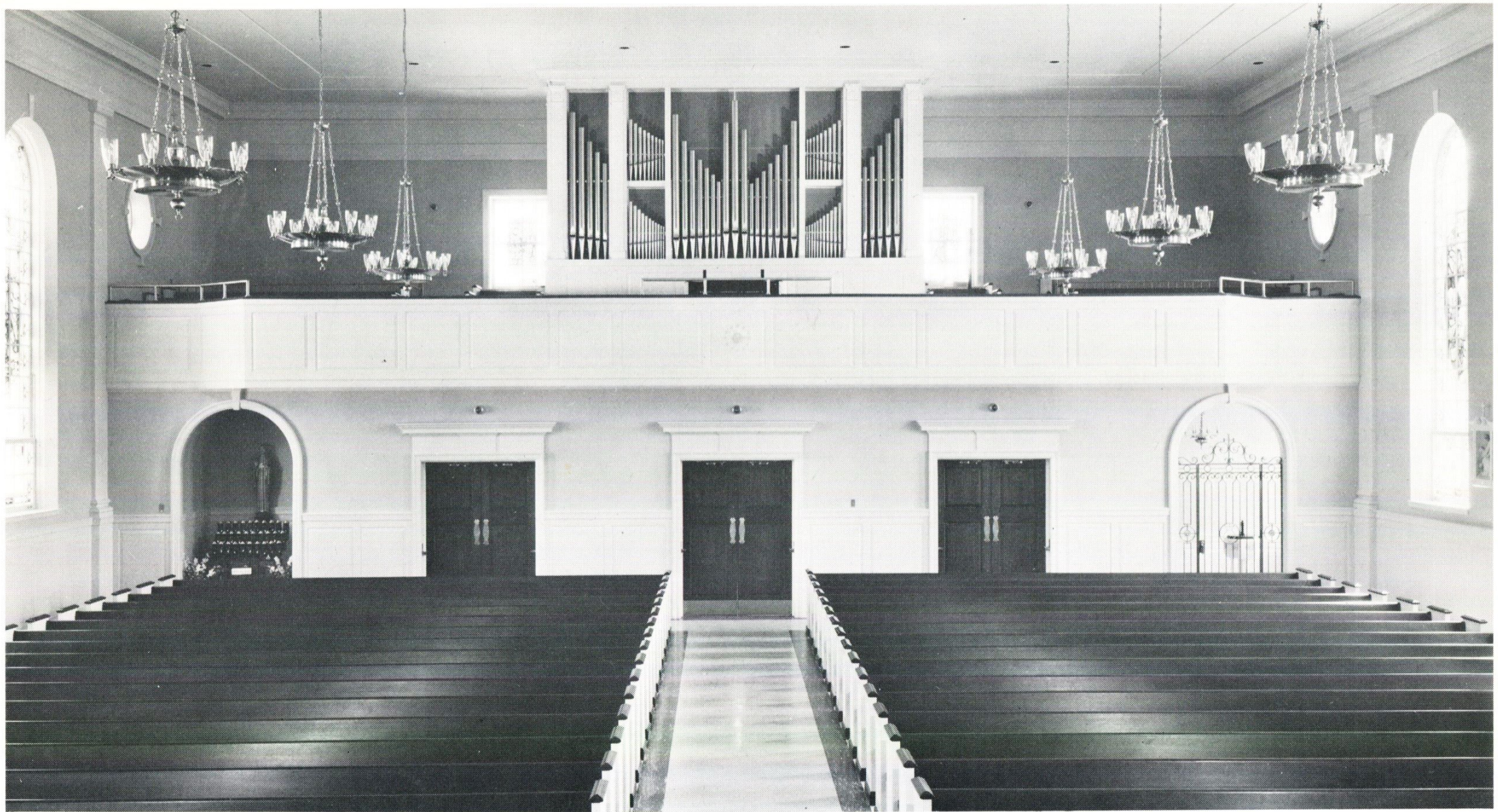
THE AUSTIN ORGAN in Church of the Holy Spirit (R. C.)