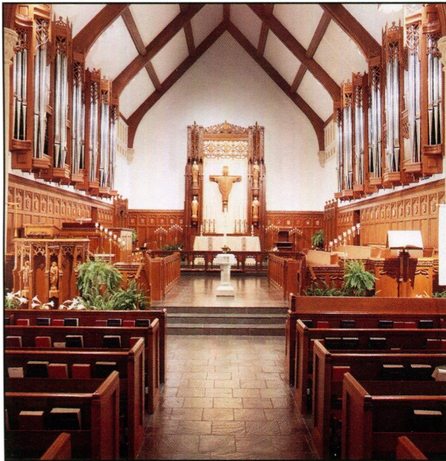
The High Altar showing organ cases on either side of the Chancel