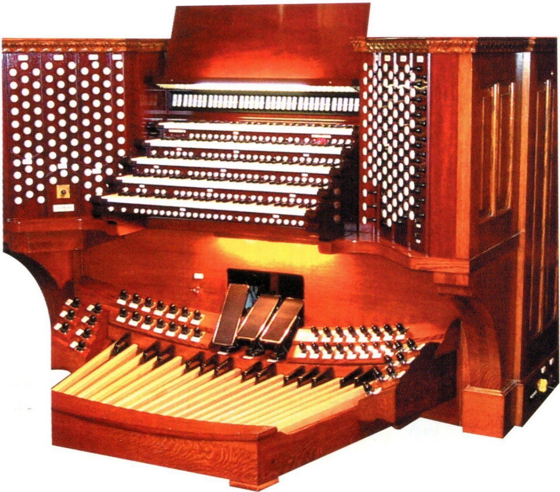
The five-manual organ console built by Robert M. Turner of Hacienda Heights, California

The organ is equipped with the following state-of-the-art equipment: