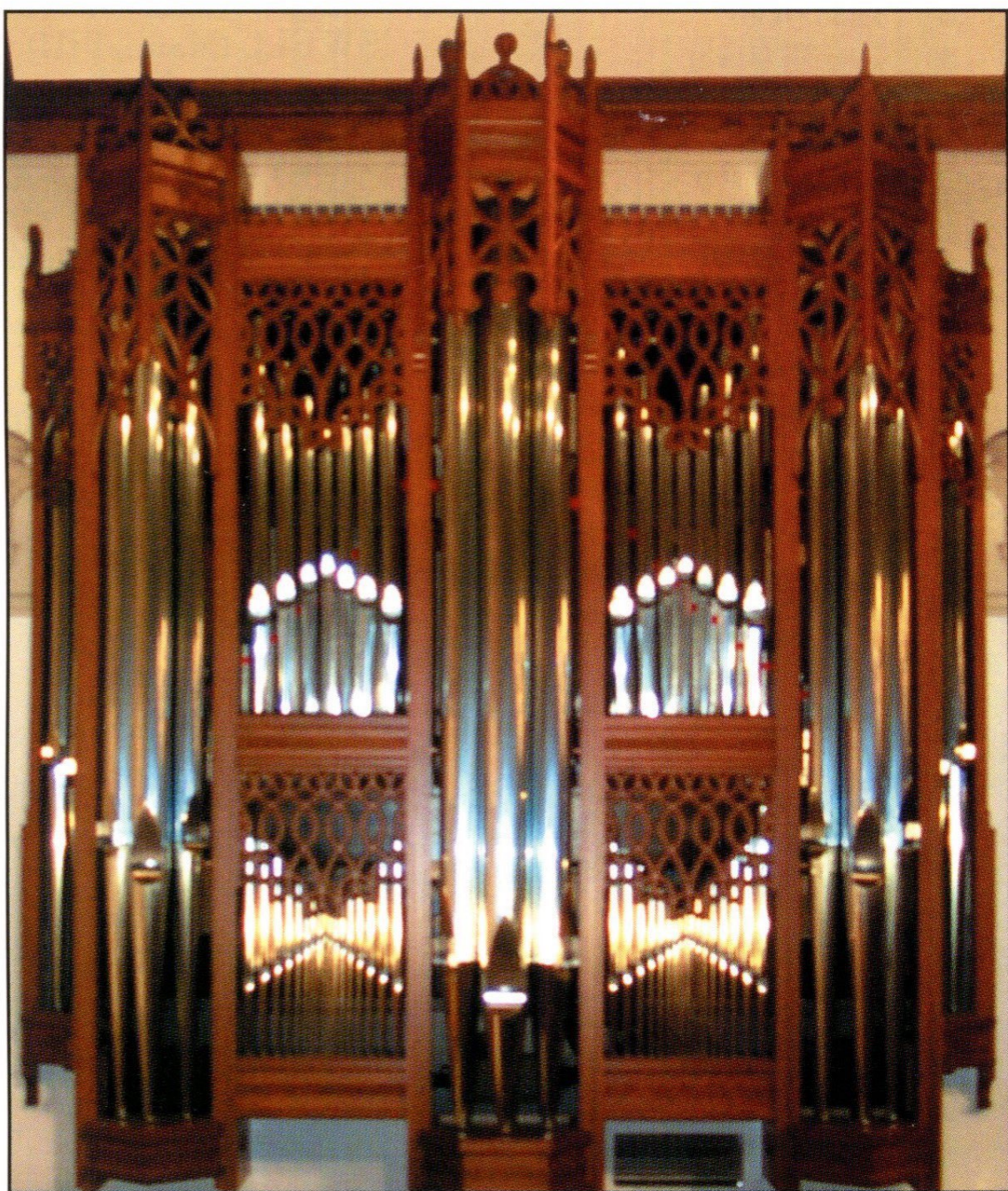
One of the four Chancel organ cases