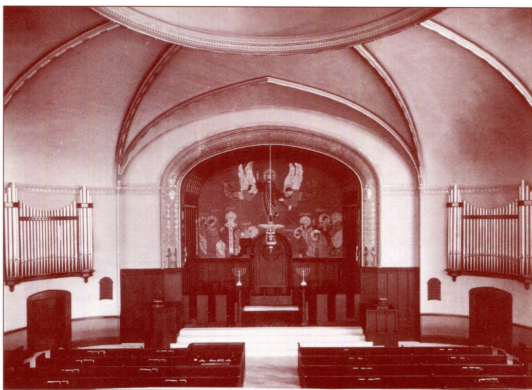
The 1924 Bennett organ had two sets of pipes above each exit door.