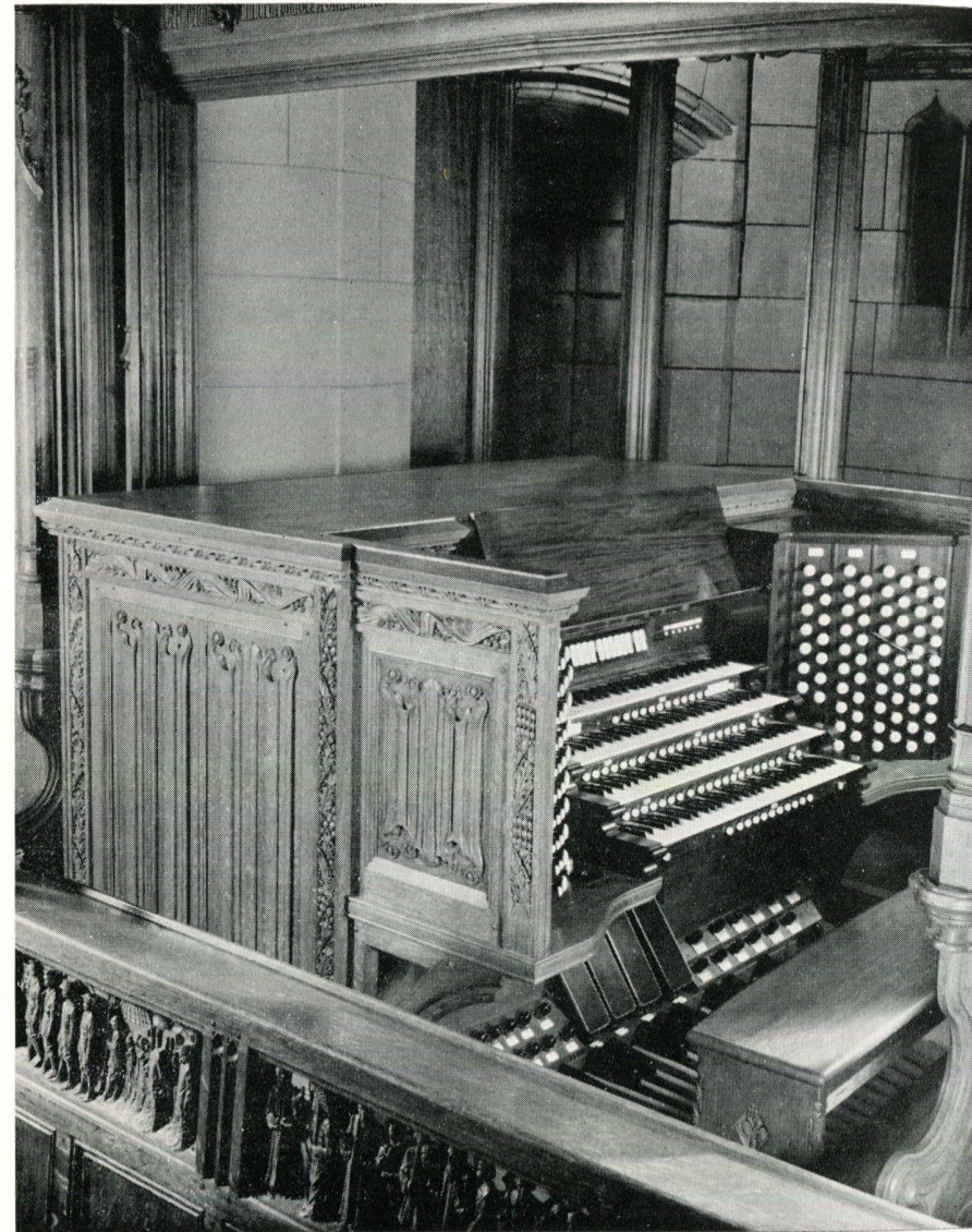
The console is of elaborately carved oak and mahogany and contains the 145 drawknobs and 12 couplers which control the 8,905 pipes of the organ.