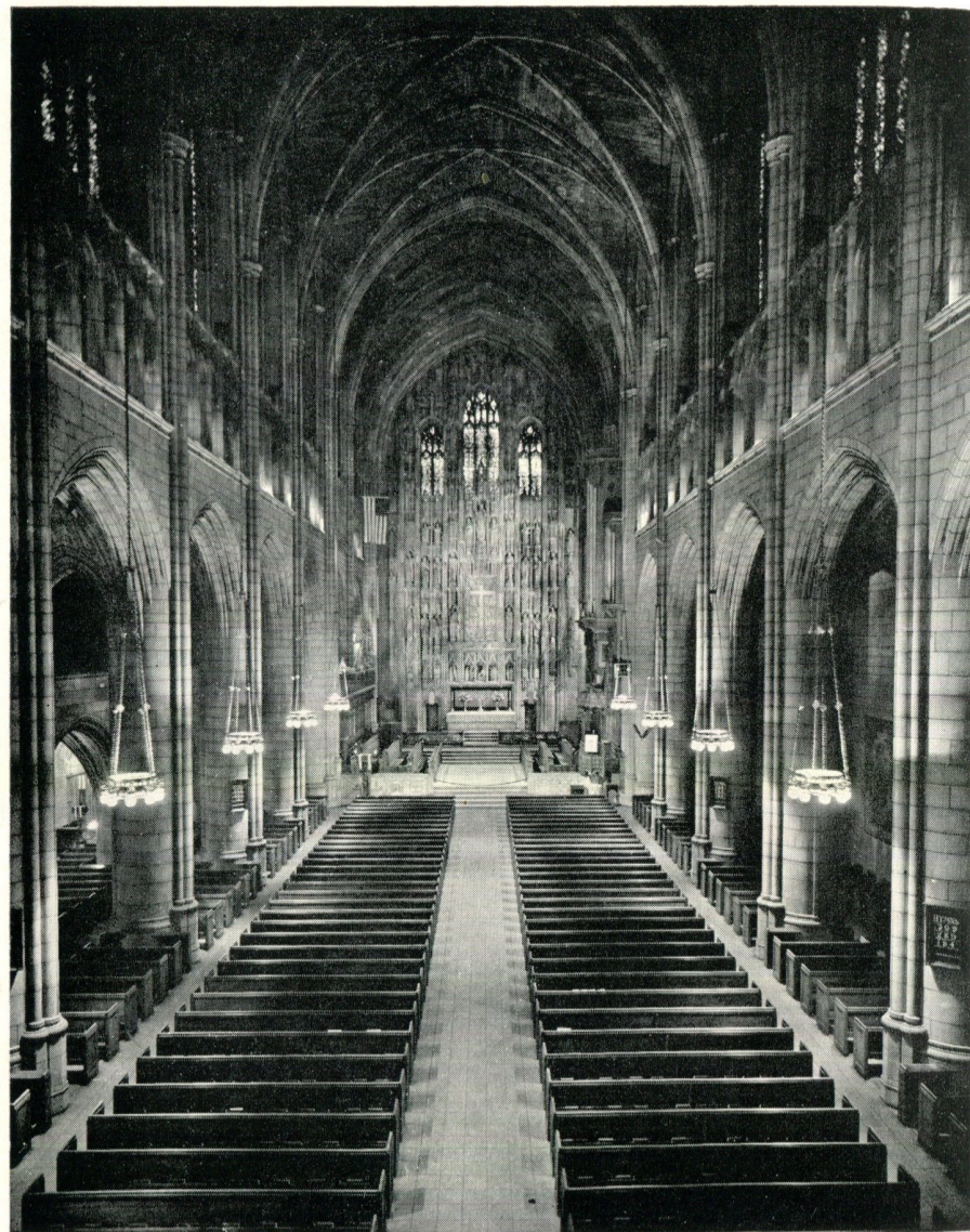
Saint Thomas' Church NEW YORK CITY