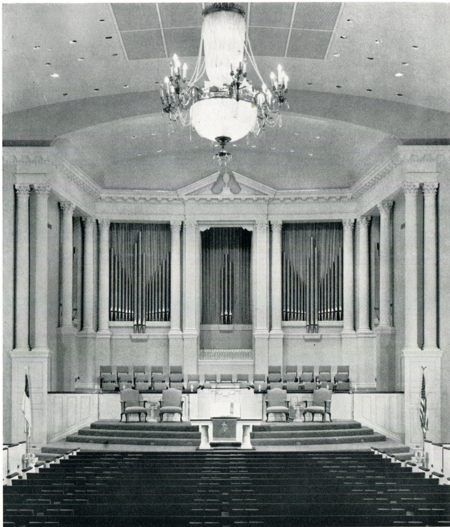
BRAINERD BAPTIST CHURCH CHATTANOOGA, TENNESSEE

Austin Organs, Incorporated HARTFORD, CONNECTICUT 06101