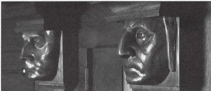
Four carved faces from the old organ have been incorporated into the new organ case. Who they represent is an enduring mystery.

The unenclosed Solo has no keyboard of its own, but can be assigned to Great, Swell, and/or Pedal. It contains both the softest and the loudest sounds in the organ. The beautiful Skinner Flauto Dolce and Flauto Dolce Celeste are the instrument's pianissimo voices and provide contrast in color and volume to the more assertive strings on the Swell. The Harmonic Flute changes character through its compass: the bass is a lovely, mellow accompanimental stop, which steadily increases in strength to form a lyrical solo voice in the treble. The Trumpet is full-bodied and bold, and is extended into the Pedal to provide a 16' stop of real authority, giving the Pedal the grandeur of a large organ.