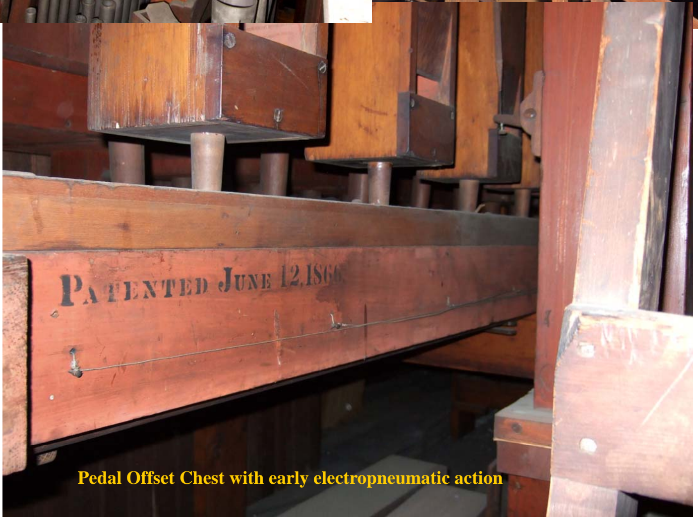
Pedal Offset Chest with early electropneumatic action