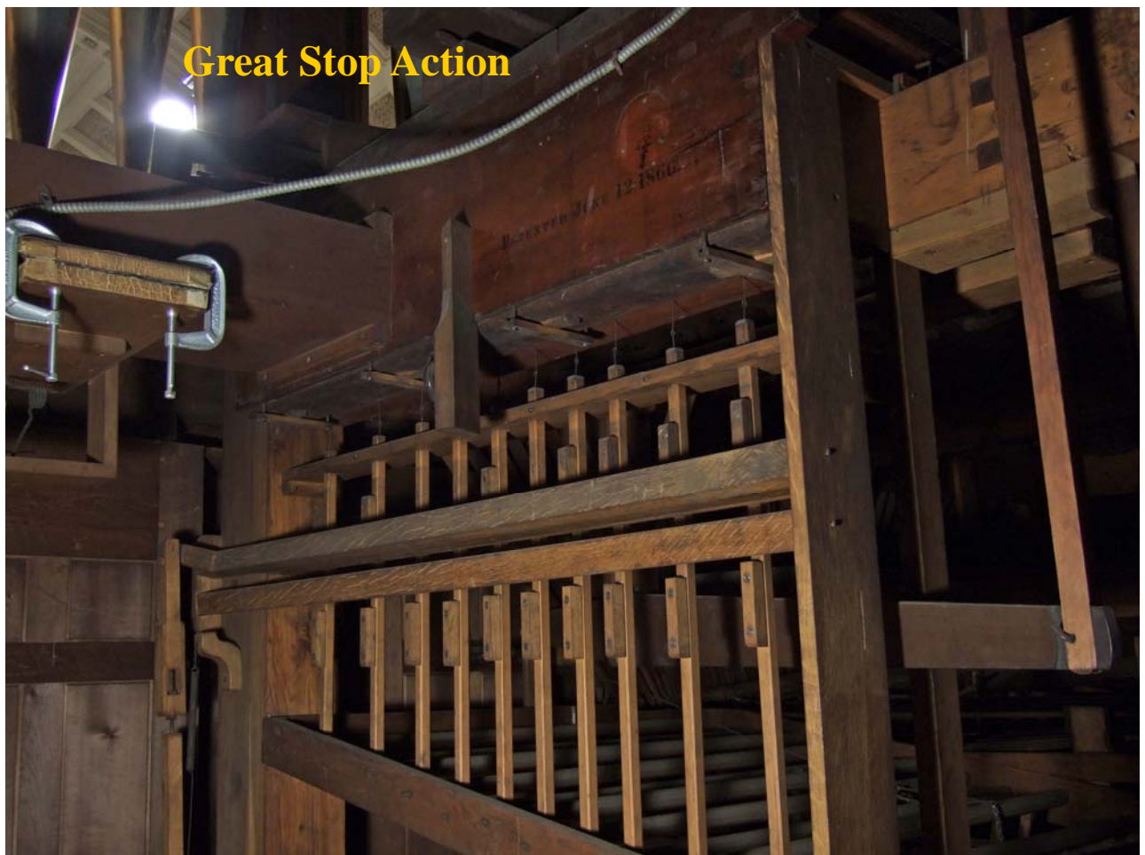
Great Stop Action