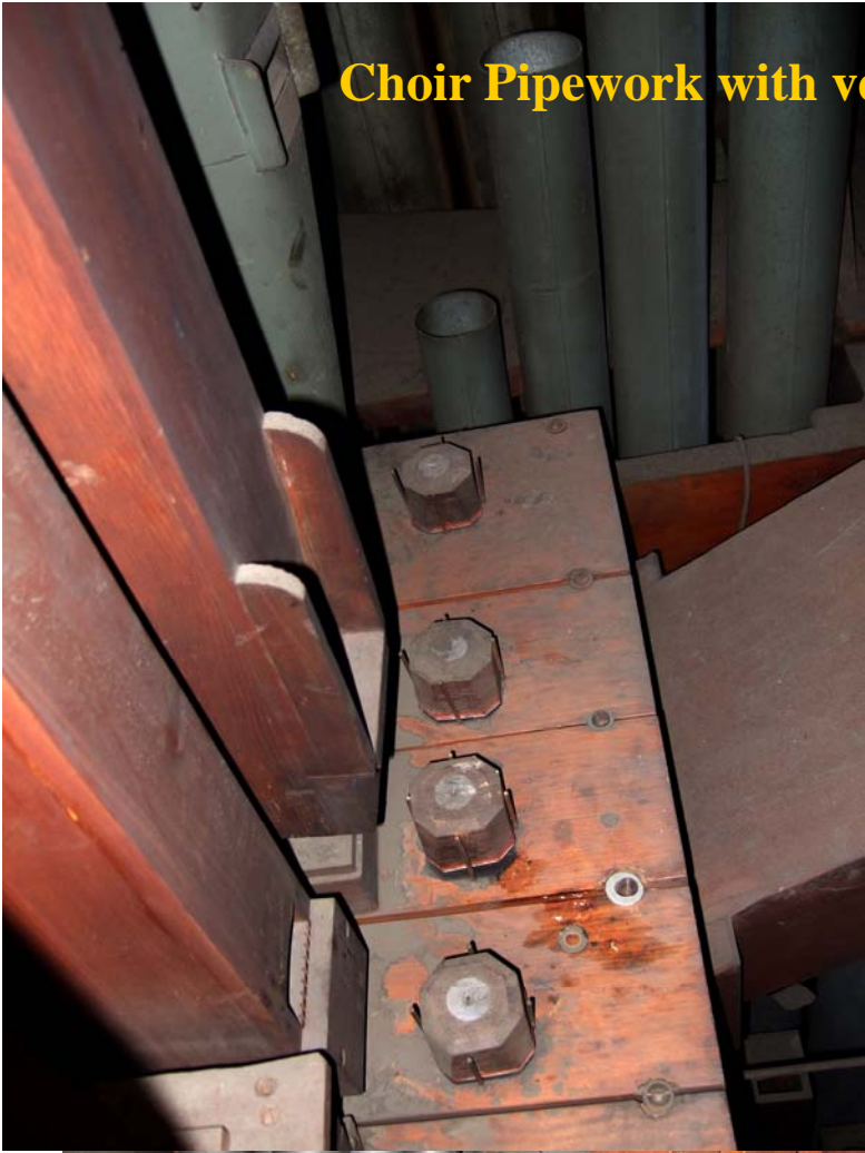
Choir Pipework with ventil bleeders