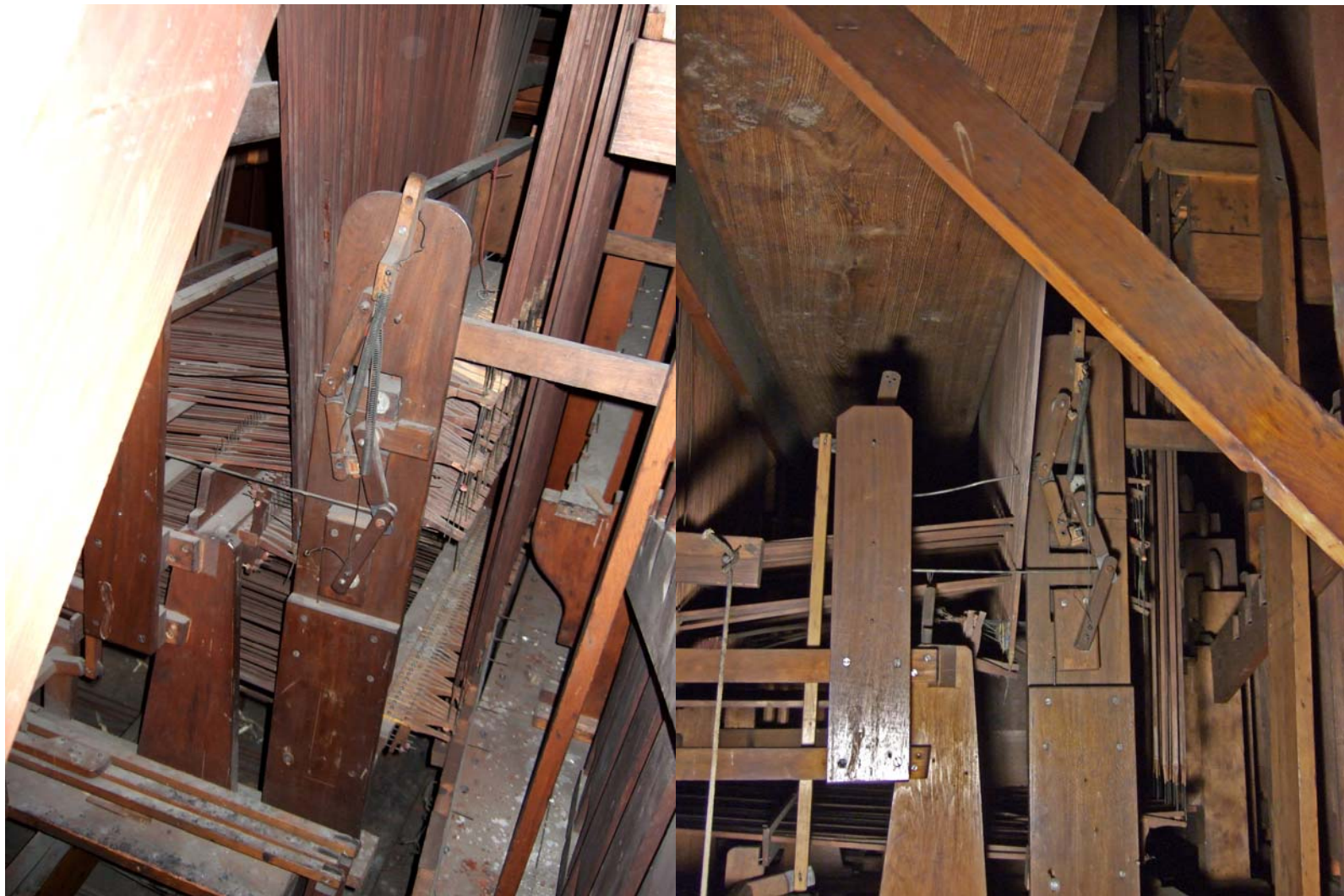
Barker Machine with attendant couplers