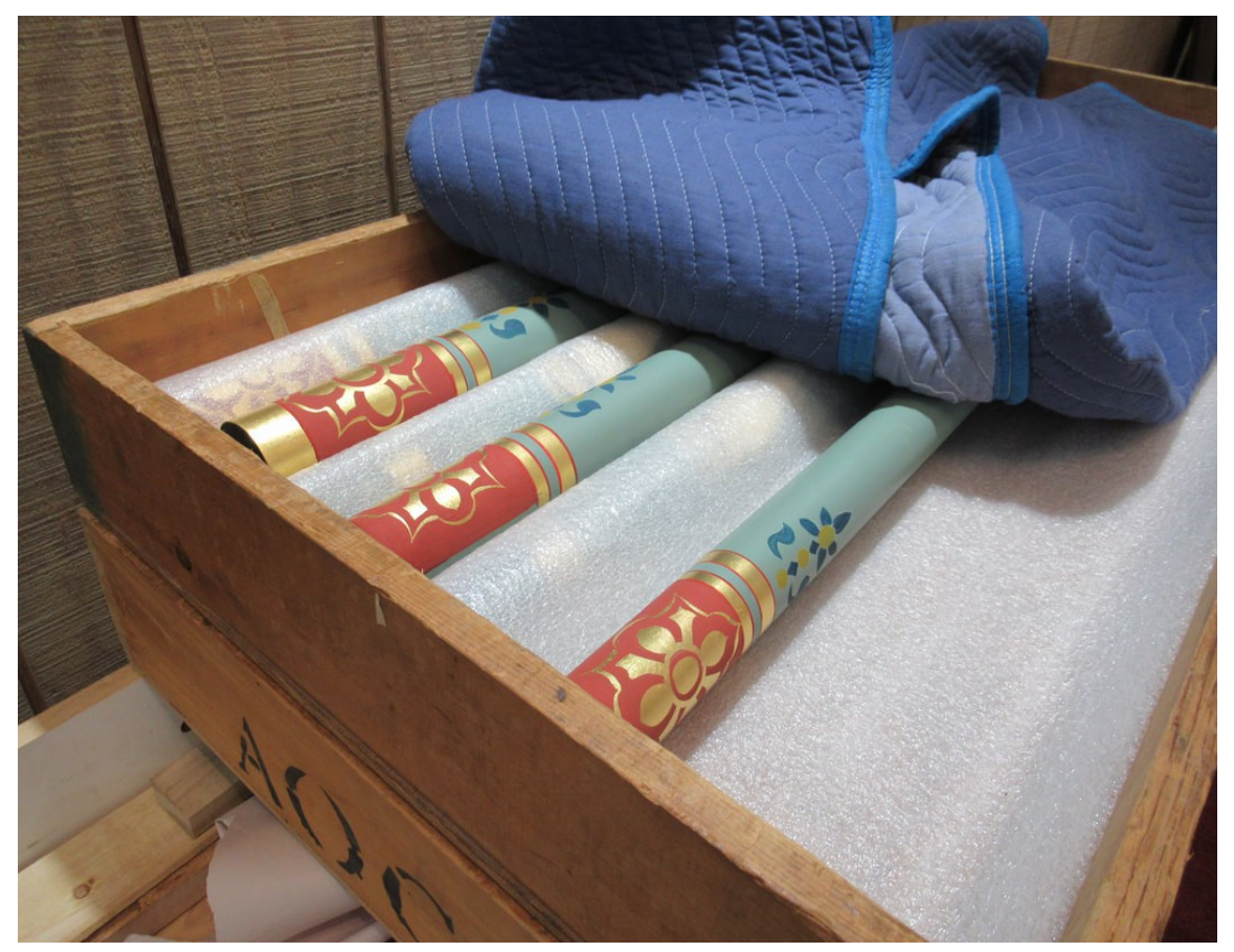
Close up of 3 pipes from the organ at Saint Stephen Lutheran Church, painted in its original 19th Century design.