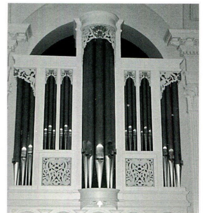
1996 Choir Case

"...let the whole world see and know that things which were cast down are being raised up, and things which had grown old are being made new... "