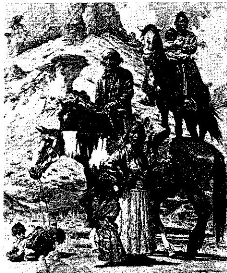
"The Dinneh" portrays three generations of Navajos.