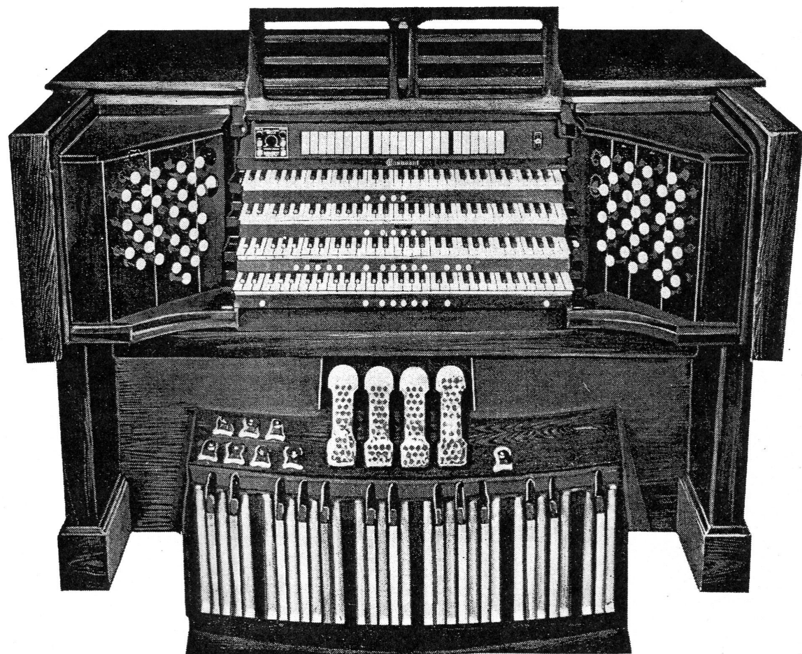
THE NEW ORGAN

In 1914 it was decided to rebuild, enlarge to three manuals, and electrify throughout this organ. This work was carried out by Casavant Frères at a cost of between eleven and twelve thousand dollars. The rebuilt organ was used for the first time on Sunday, December 20th, 1914.