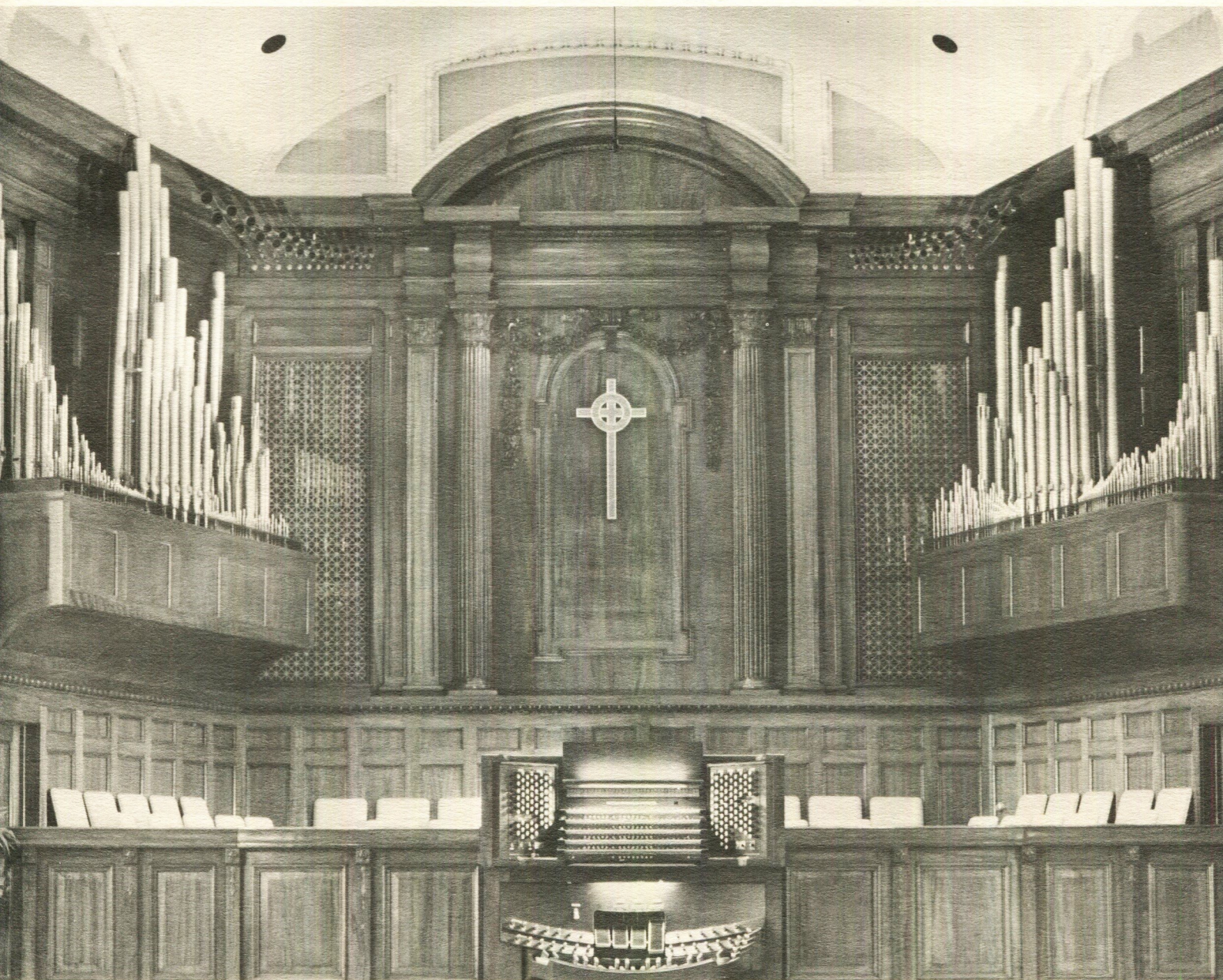
The Sanctuary Organ