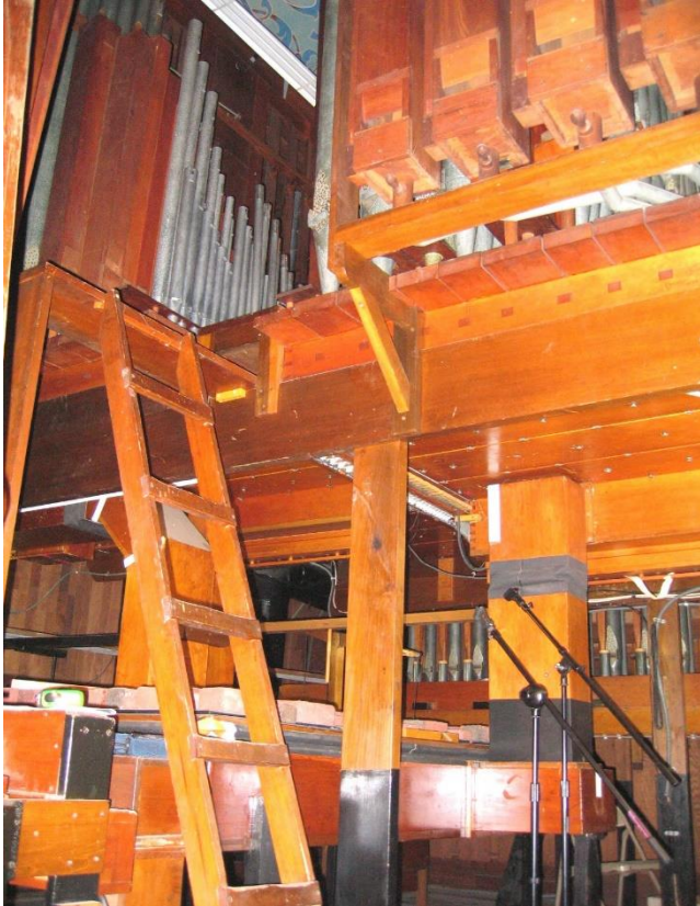
View from the entrance door