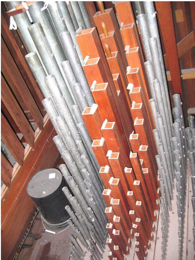
Left rear banks of pipes, see louvers in rear.