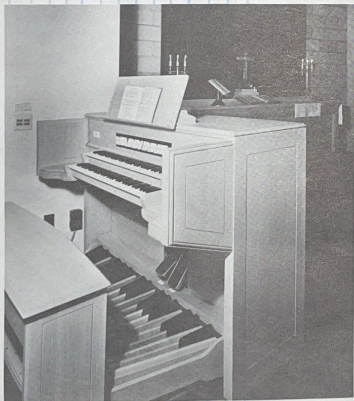
Detached console conforms to standards recommended by the American Guild of Organists and requires a space approximately 5 ft. square.

Realizing a definite responsibility to the small church and chapel, MÖLLER has painstakingly studied the problem and the results are the NEW 70 SERIES PIPE ORGANS. Materials and workmanship are of the same high quality that have made the name MÖLLER synonymous with the best for nearly a century.