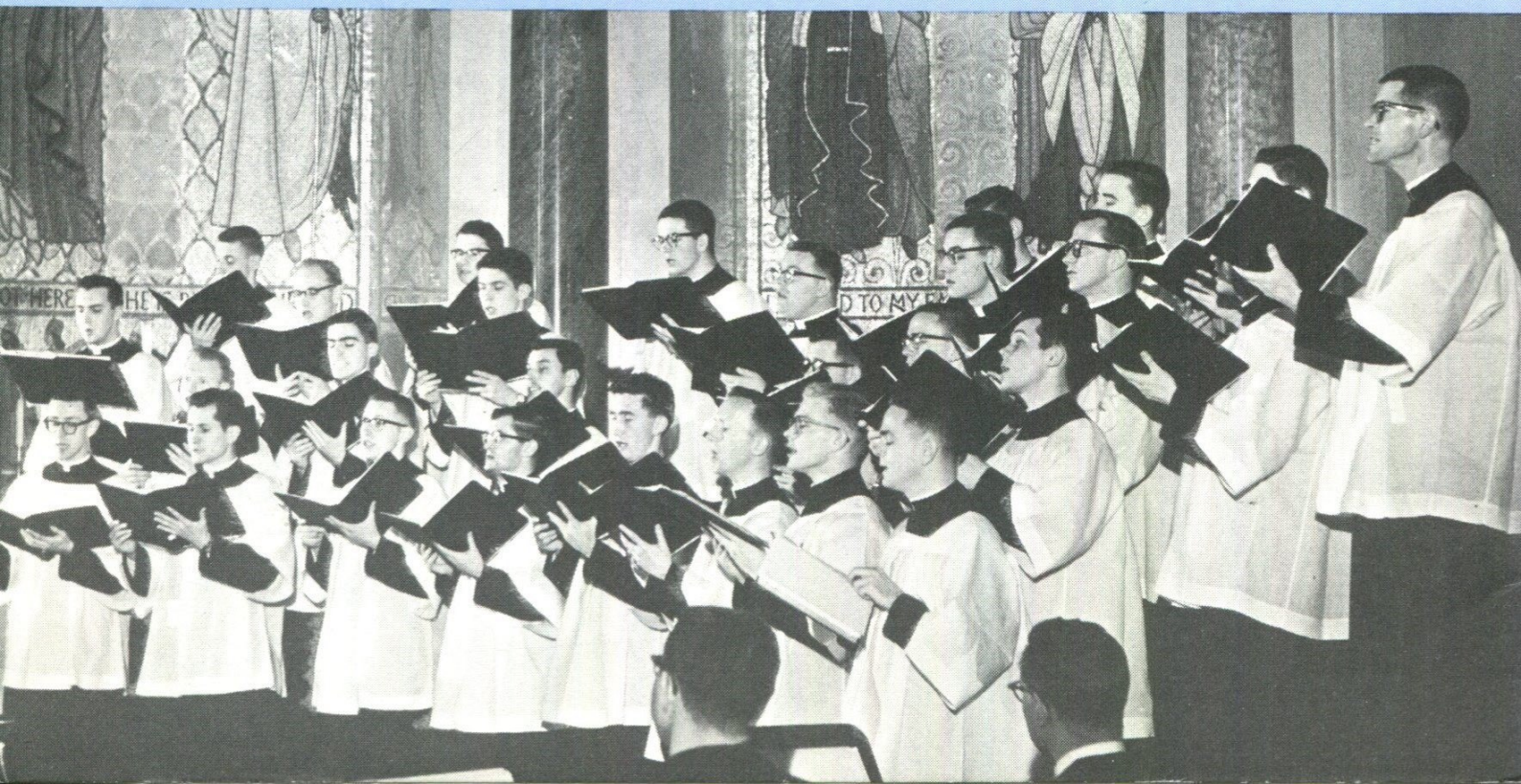
Marist College Choir, Midnight Mass 1963