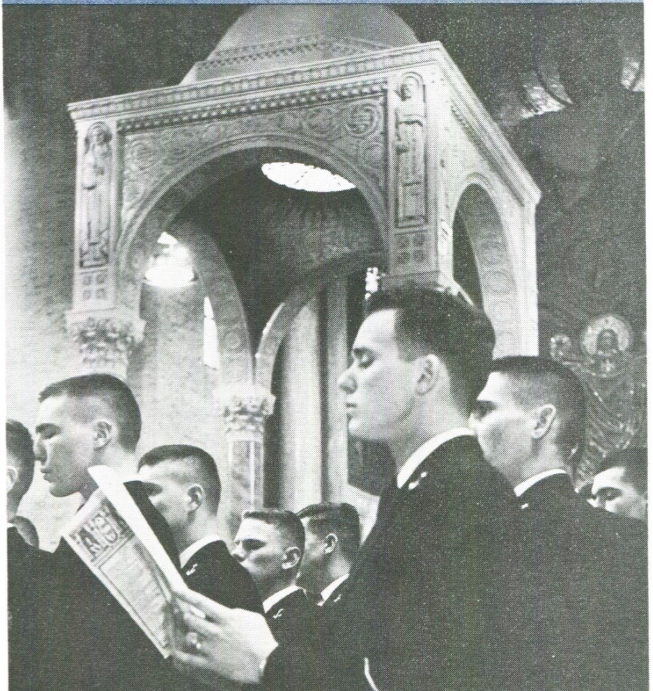
Catholic Choir of the U.S. Naval Academy