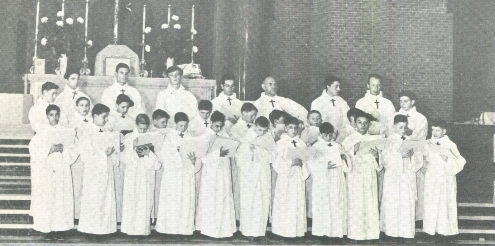
Little Singers of Paris, Christmas Mass 1959